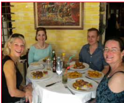
Enjoying lunch in a “private restaurant” located within a home.

Travel to Cuba is restricted by the Office of Foreign Assets Control (OFAC) of the United States Treasury Department. The delegation travelled under a General License for professional research, which provided the delegation with access to the highest level of professionals in Cuba.