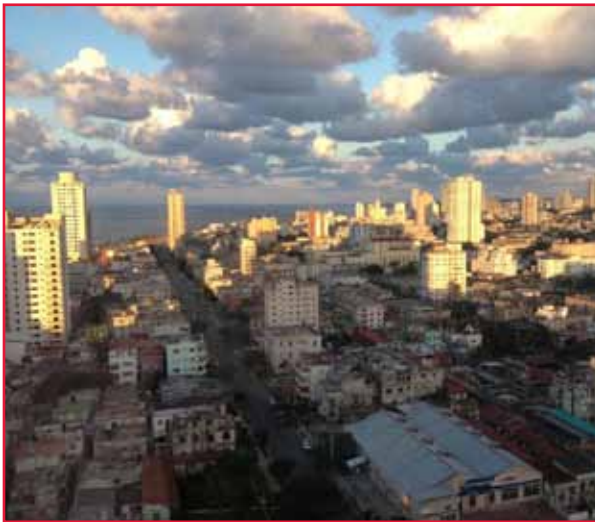
A beautiful view of Havana, Cuba.