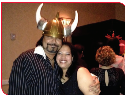
More photo booth fun!