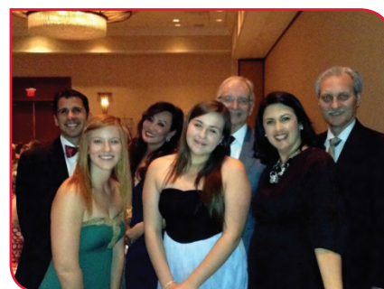
Table 2 Group!