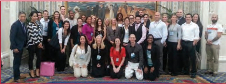
Our group of Barry University SRNAs