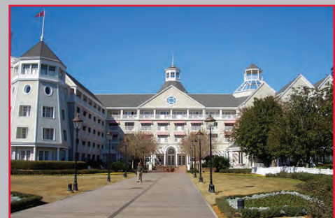
From the Boardwalk at the Disney Yacht Club Resort

For our students, it was an opportunity to discover the professional world they will soon be a part of and build connections. Perhaps among them is a future FANA president or vice president? They have the potential!