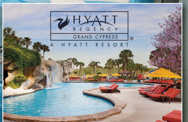
Hyatt Regency Grand Cypress Hotel

Surgery • Orthopedics • Primary Podiatric Medicine