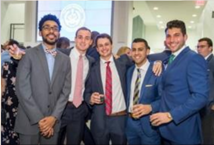
Villanova Law's "Red Mass" cocktail event