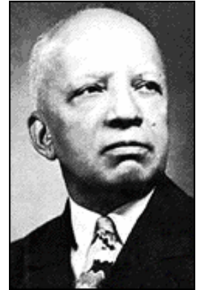
Dr. Carter G. Woodson

In the United States, Americans have recognized black history since 1926. What we now know as “Black History Month” began as “Negro History Month.” The main push for the recognition and study of black history came from Dr. Carter G. Woodson, who established the Association for the Study of Negro Life and History in attempts to bring light to the contributions of blacks in America. Thanks to his hard work and determination, we now celebrate Black History Month every February.