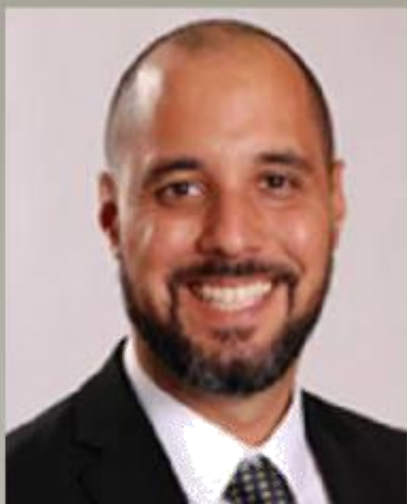
Associate Vice Provost for Student Success and Undergraduate Studies

“I think the major challenge facing students today is triviality. I think we live in a society today that rewards the emptiest and most ostentatious individuals. The challenge for students today is to find the occupation worthy of their developing aspirations and attitudes... we live in a culture where it's very easy to choose glitz over substance. Students should prepare to find meaning in their chosen career and life.”