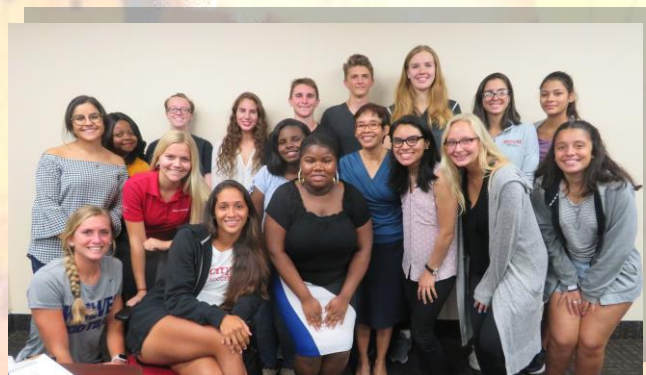
New HP students with 3 returning students & HPSAB