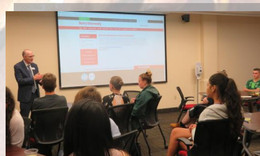
Provost explaining HP expectations and benefits