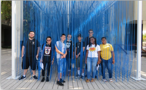
Our HP students enjoying Jesús Rafael Soto's Penetrable sculpture