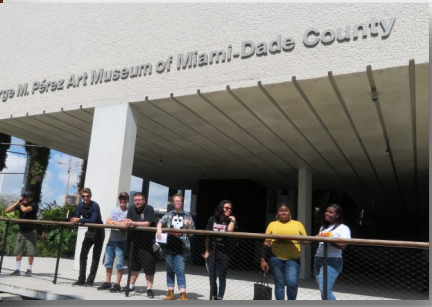
Students appreciating Miami's warm sun