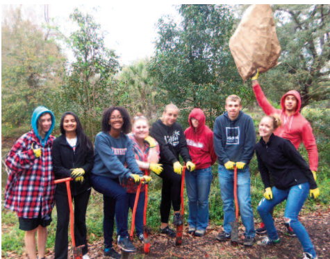
For Alternative Spring Break, Barry University students planted trees and flowers at APEX, a youth center in New Orleans.