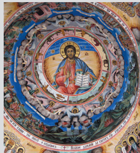
Religious paintings at Rila Monastery in Bulgaria