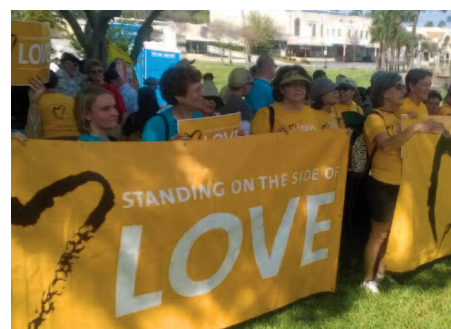
Protest with the Coalition of Immokalee Workers in Lakeland, Florida