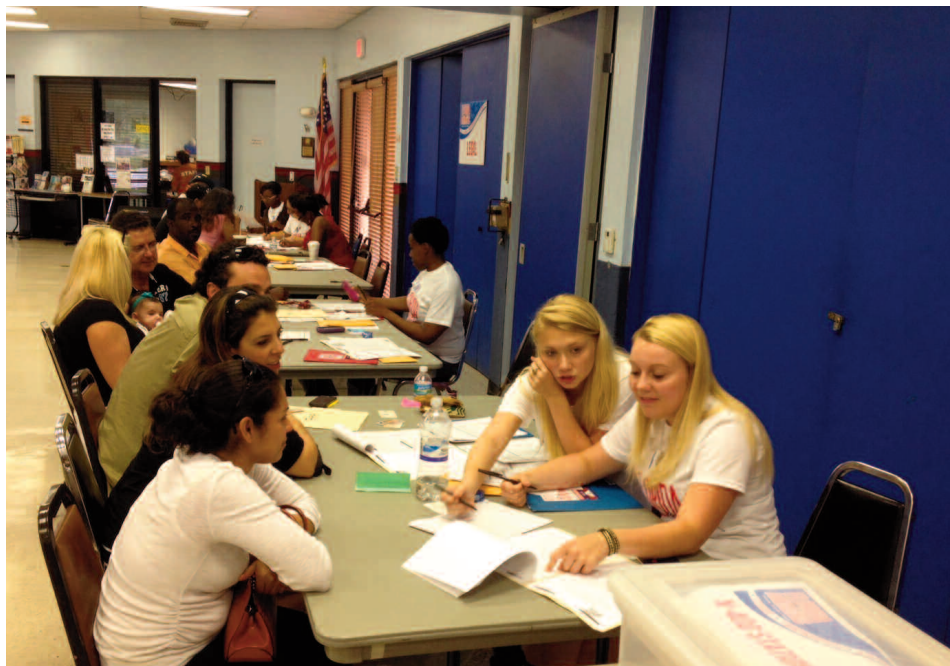
Florida New Americans Citizenship Clinic