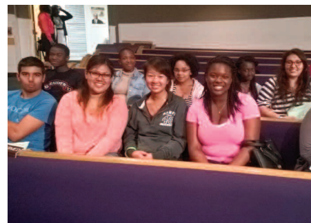
Miami PACT Assembly